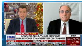
FOX BUSINESS: Cavuto: Coast to Coast