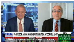
FOX BUSINESS: Varney & Co.