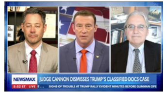
Newsmax: Carl Higbie Frontline