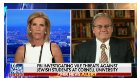
FOX: The Ingraham Angle