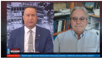
Salem TV: WILKOW!