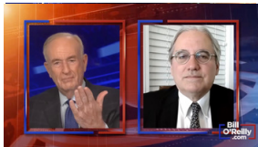
No Spin News w/ Bill O'Reilly