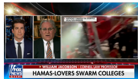
FOX: Jesse Watters Primetime