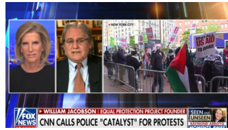
FOX: The Ingraham Angle