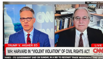
CNN: Jake Tapper