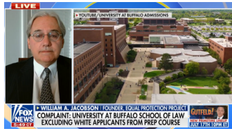
FOX & Friends