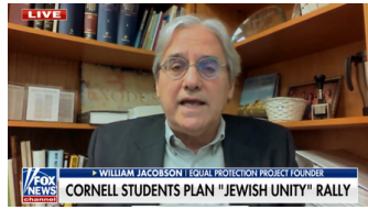
FOX: America Reports