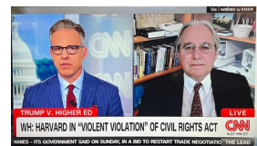
CNN: Jake Tapper