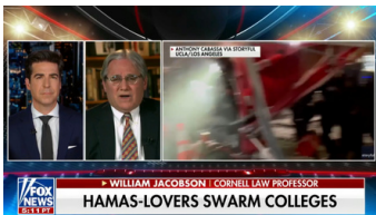
FOX: Jesse Watters Primetime