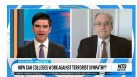
NTD News Live