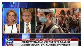
FOX: The Ingraham Angle