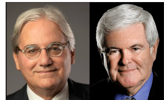
Newt's World w/ Speaker Newt Gingrich.