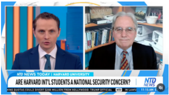
NTD News: News Today