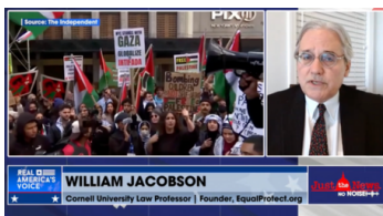
JustTheNews w/ John Solomon