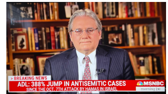
MSNBC: Morning Joe