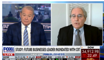
FOX BUSINESS: Varney & Co.