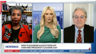
Newsmax: National Report