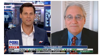
FOX BUSINESS: Evening Edit