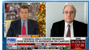
FOX: Cavuto Coast to Coast