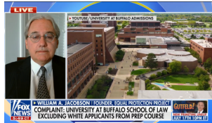
FOX & Friends