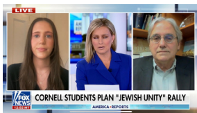
FOX: America Reports