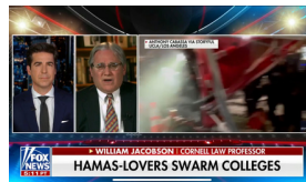
FOX: Jesse Watters Primetime