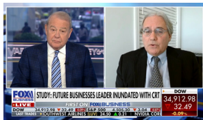
FOX: Varney & Co.