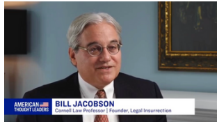
Epoch Times TV