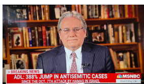
MSNBC: Morning Joe