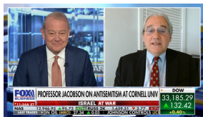
FOX: Varney & Co.