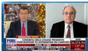
FOX: Cavuto: Coast to Coast