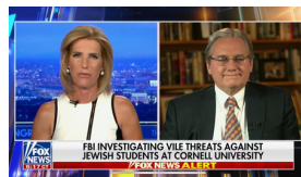
FOX: The Ingraham Angle