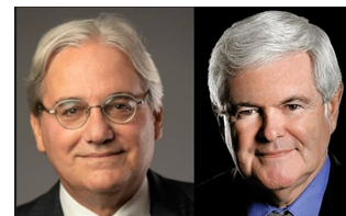
Newt's World w/ Speaker Newt Gingrich.