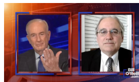
No Spin News w/ Bill O'Reilly