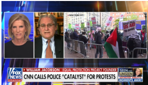
FOX: The Ingraham Angle