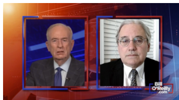
No Spin News w/ Bill O'Reilly