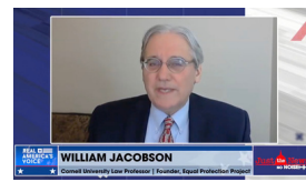
Just The News: No Noise w/ John Solomon