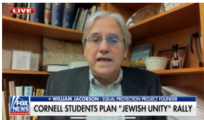
FOX: America Reports