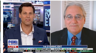
FOX: Evening Edit