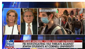
FOX: The Ingraham Angle