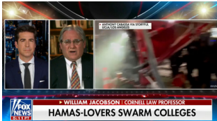
FOX: Jesse Watters Primetime