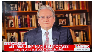
MSNBC: Morning Joe