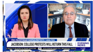
NTD: Evening News