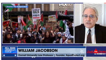
JustTheNews w/ John Solomon