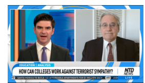
NTD News Live